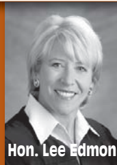
Hon. Lee Edmon